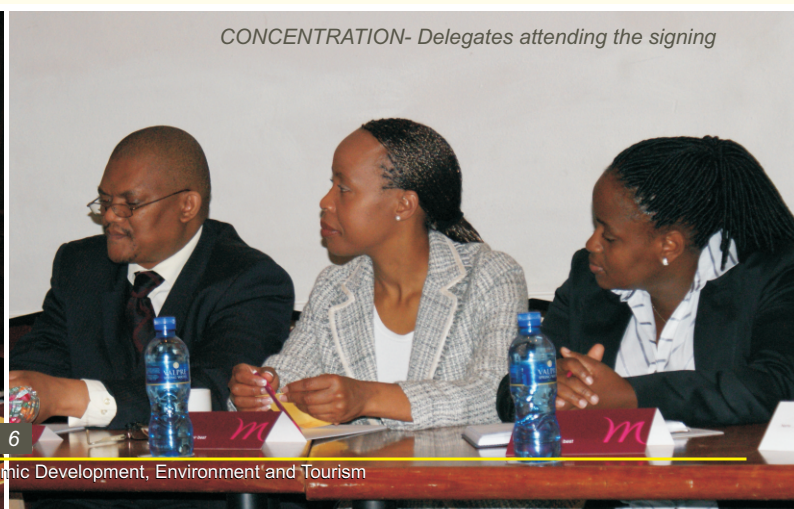
CONCENTRATION- Delegates attending the signing