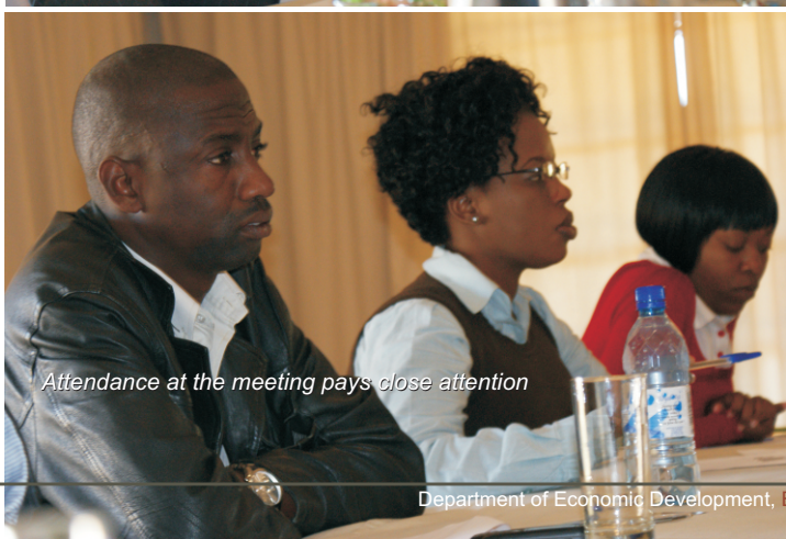
Attendance at the meeting pays close attention