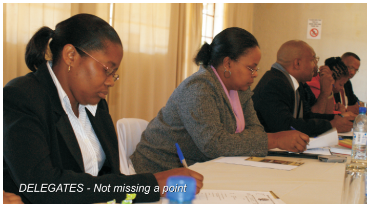
DELEGATES - Not missing a point