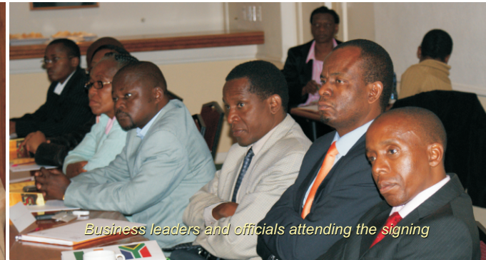
Business leaders and officials attending the signing

T he DEDET and Companies and Intellectual Property Registration Office (CIPRO) concluded an agreement through which the business registration services will be provided in the province.